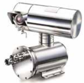
Picture shows EX286W PTZ JB with wiper and sunshield